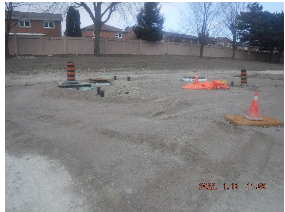
Chamber Backfill & Grading