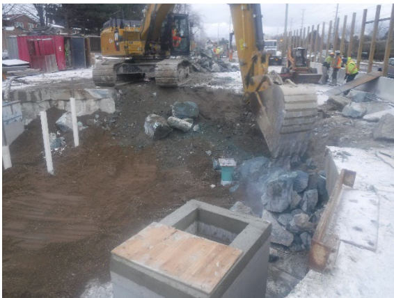
Removal Shaft Support Systems

We anticipate our work will be done by mid 2022. Your patience is appreciated as we build the necessary water infrastructure to support Mississauga's growing downtown core.