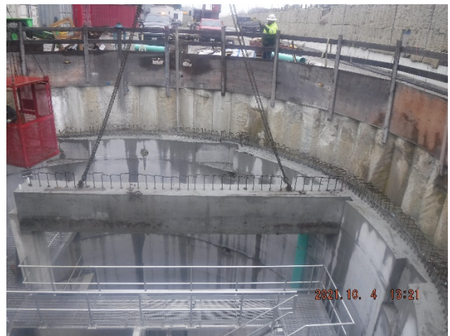
Installation Roof Beams & Electrical Conduits