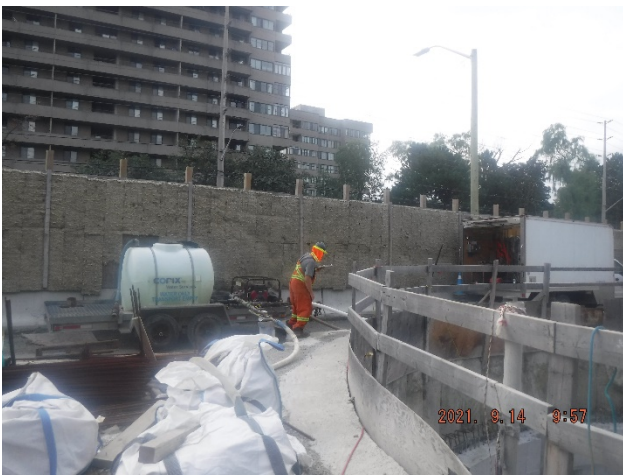
Pressure Testing 1500 Watermain

We anticipate our work will be done by the end of 2021. Your patience is appreciated as we build the necessary water infrastructure to support Mississauga's growing downtown core.