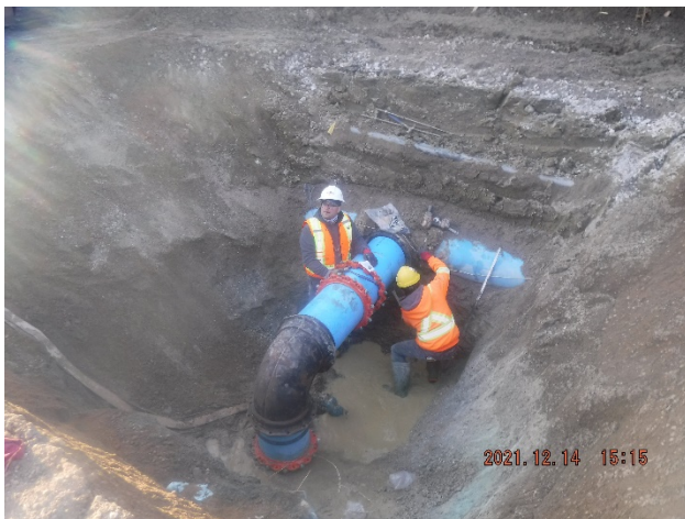
Watermain connection with 400mm watermain

We anticipate our work will be done by mid 2022. Your patience is appreciated as we build the necessary water infrastructure to support Mississauga's growing downtown core.