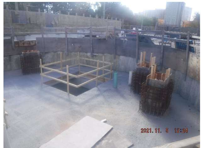
Installation of roof topping slab and chamber chimneys