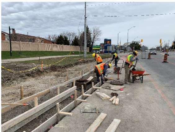
Concrete Curb Restorations

We anticipate our work will be done by mid 2022. Your patience is appreciated as we build the necessary water infrastructure to support Mississauga's growing downtown core.