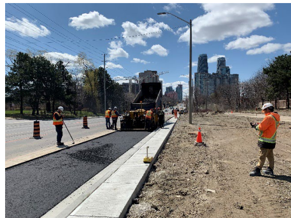
Asphalt Restoration for Roadway