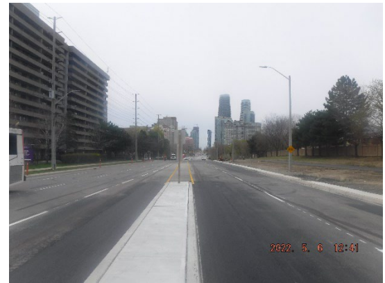
Asphalt, Median & Roadway Restoration