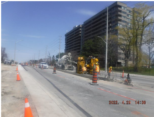
Road Median Restorations

We anticipate our work will be done by mid 2022. Your patience is appreciated as we build the necessary water infrastructure to support Mississauga's growing downtown core.