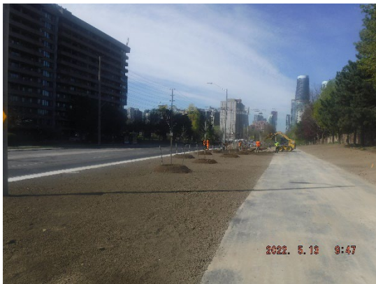
Tree & Topsoil Restorations