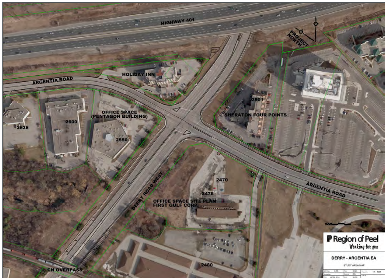
Figure 1: Study Area Key Map

This report was prepared to document the Stormwater Management Strategy associated with the proposed intersection improvement at the Derry Road and Argentia Road Intersection.