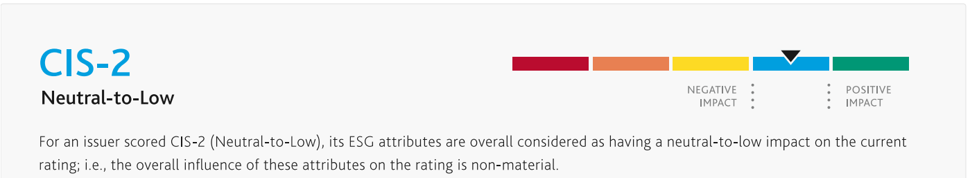
Exhibit 3 ESG Credit Impact Score

Peel's ESG Credit Impact Score is Neutral-to-Low CIS-2