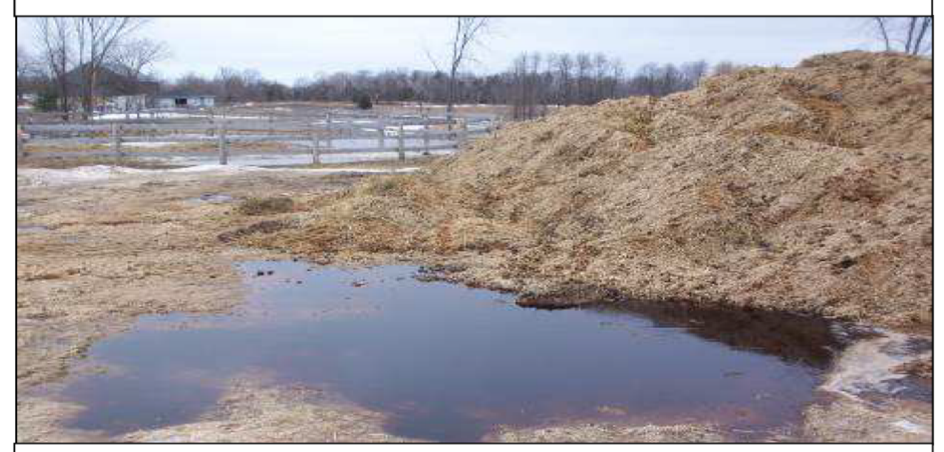
This equates to 36,557 dump trucks of manure!

Safely store 292,453 m<sup>3</sup> of livestock manure to reduce the risk of nutrient, pathogen and bacteria contaminating drinking water, streams and wetlands.