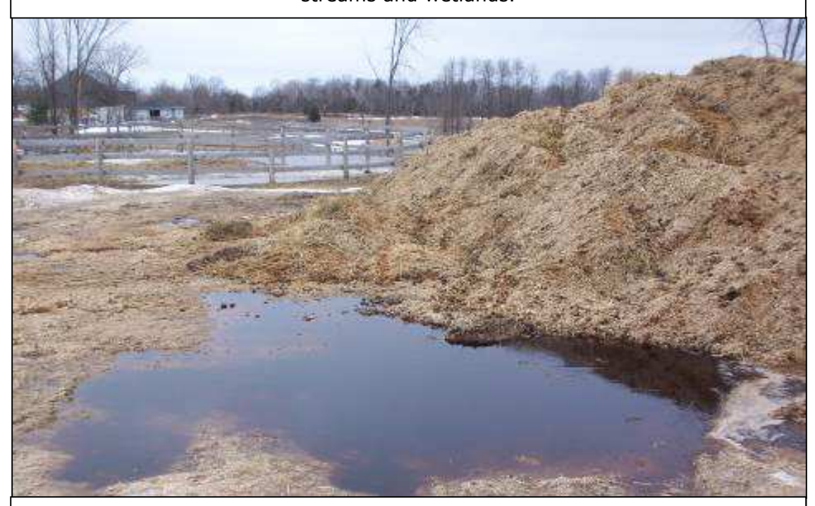
This equates to 38,092 dump trucks of manure!

Safely store 265,125 m³ of livestock manure to reduce the risk of nutrient, pathogen and bacteria contaminating drinking water, streams and wetlands.