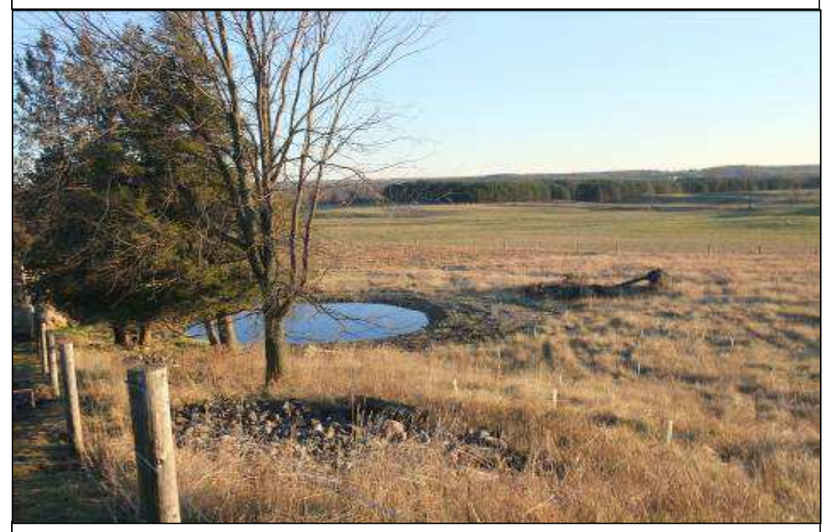
This is an area equal to 114 football fields!