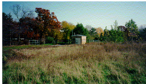
North Sheridan Landfill, Mississauga